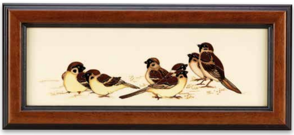
PLQ3 | Numbered Edition

Every now and again, a great design will emerge from Moorcroft – one which, by its very nature, will cause heads to turn and collectors to open their doors and bring it into their homes. These designs do not have to cost a fortune to be wrapped in that prized cloak of greatness. Indeed, their simplicity can bring them from nowhere to play with our emotions and remain with us for ever thereafter. There can hardly be a less likely subject for greatness than a group of seven tree sparrows, their plain brown and grey-fawn plumage with tell-tale black cheek spots, can hardly be said to come from the regal world of peacocks, yet here they are, posturing happily on the simplest of Moorcroft plaques. These seven sparrows is a design lining itself up to become a great piece of Moorcroft.