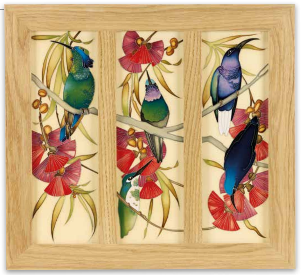
Triptych | Numbered Edition

A bouquet of hummingbirds flit between the design as your eyes fly like hummingbirds backwards, forwards, straight up and down, changing direction in a flash. With a hint of mischievous design, it is only the bright red spikes of the stylised callistemon flowers that fan like hummingbirds wings. The hummingbirds flash and dart in explosions of liquid colour to turn each panel into a remarkable work of art, yet miraculously, all three panels merge into a breath-taking performance of electric movement. Taken as a whole, each image on each panel melds into its neighbour's territory with a surprising symmetry of colour, form and movement.