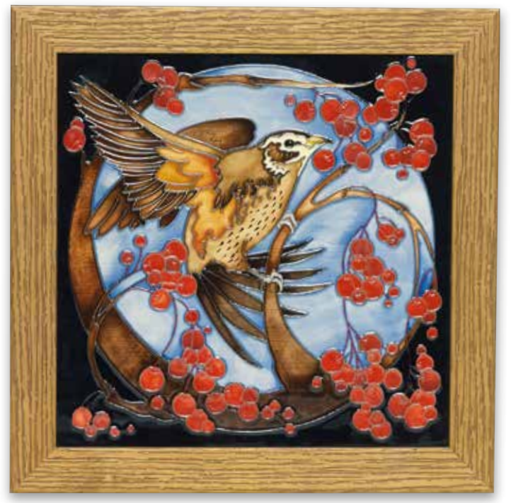
PLQ8 | Limited Edition: 50

Inspired by the rowan tree that grows beside the Moorcroft factory bearing prolific amounts of berries each year, Vicky uses the brightness of these red rowan berries and a piercing blue sky to crown the dark, mottled-browns of a redwing bird. This is one of her ways of mastering the art of incorporating nature into her work.